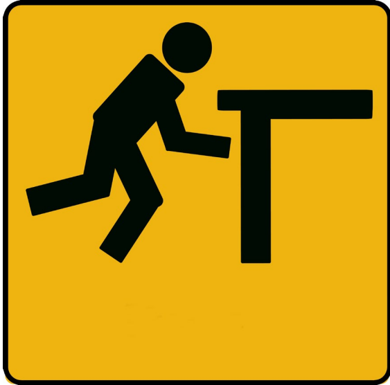
Drop (or Lock)